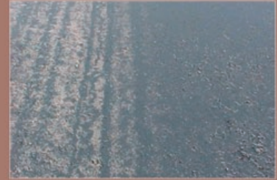
Poor Tack Coat vs Good Tack Coat