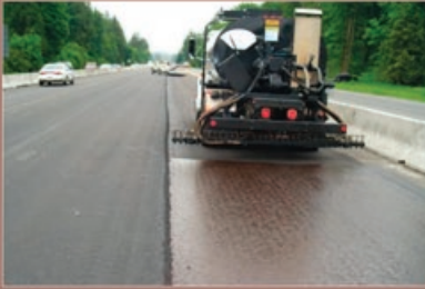
Good Tack Coat Coverage