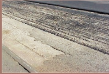
Bad Tack Coat Coverage